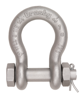
Bolt Type Anchor shackles with thin head bolt – nut with cotter pin. Meets the performance requirements of Federal Specification RR-C-271D Type IVA, Grade A, Class 3, except for those provisions required of the contractor. For additional information, see page 450.